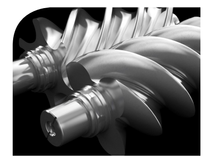
Rotors with Ultra EL