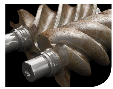
Rotors with conventional lubricant

Synthetic lubricants are better for the environment, last longer, are less expensive and are less prone to contamination and varnishing. Our family of synthetic lubricants are specifically designed to help rotary screw compressors maintain peak performance.